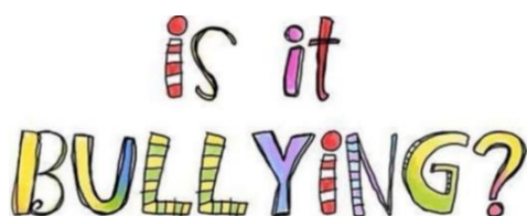
Table 1: Source - Psychology Today

Whether intended or not, hurtful behaviour must be challenged.